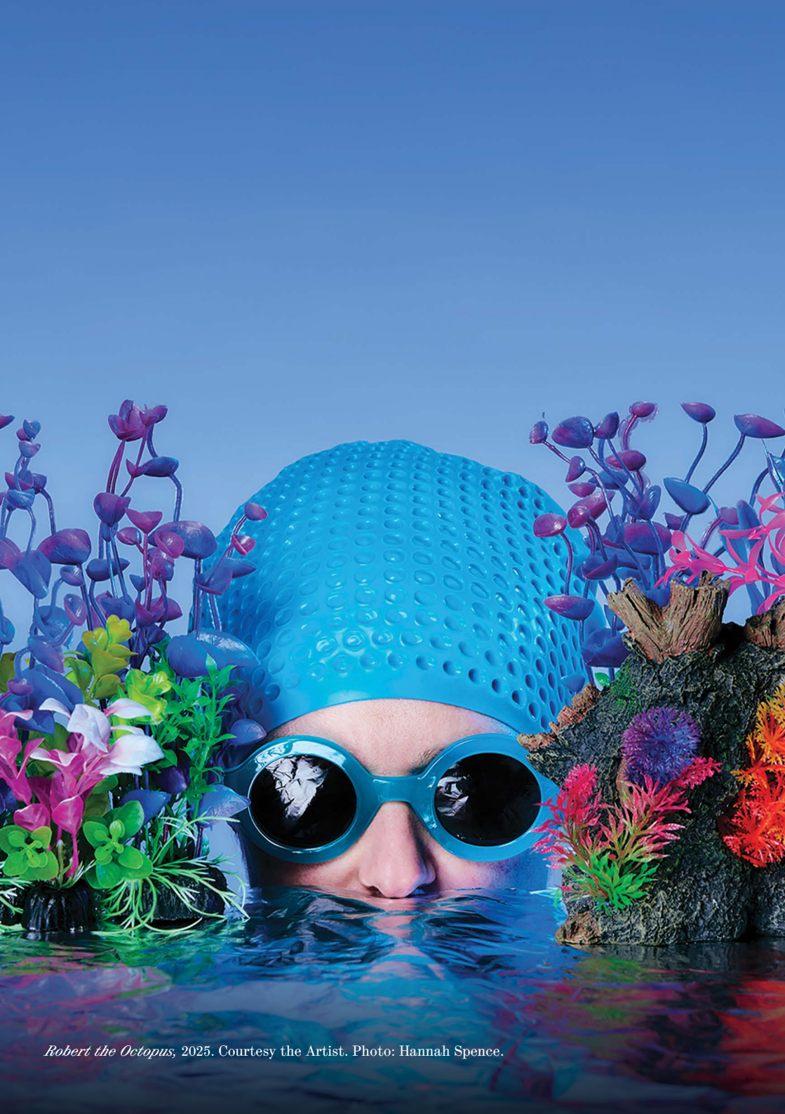
Robert the Octopus, 2025. Courtesy the Artist.