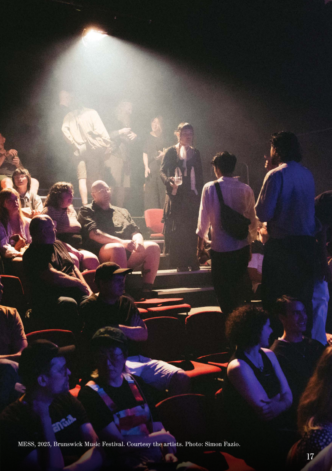
MESS, 2025, Brunswick Music Festival.