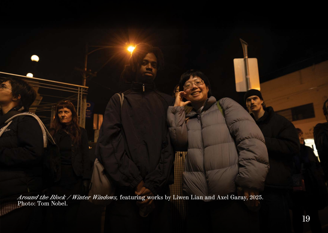
Around the Block / Winter Windows , featuring works by Liwen Lian and Axel Garay, 2025.