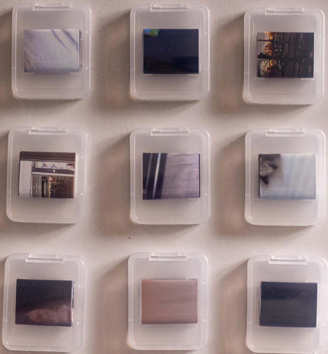
Kat Kats, What More Do You Want From Me? (detail), 2025.