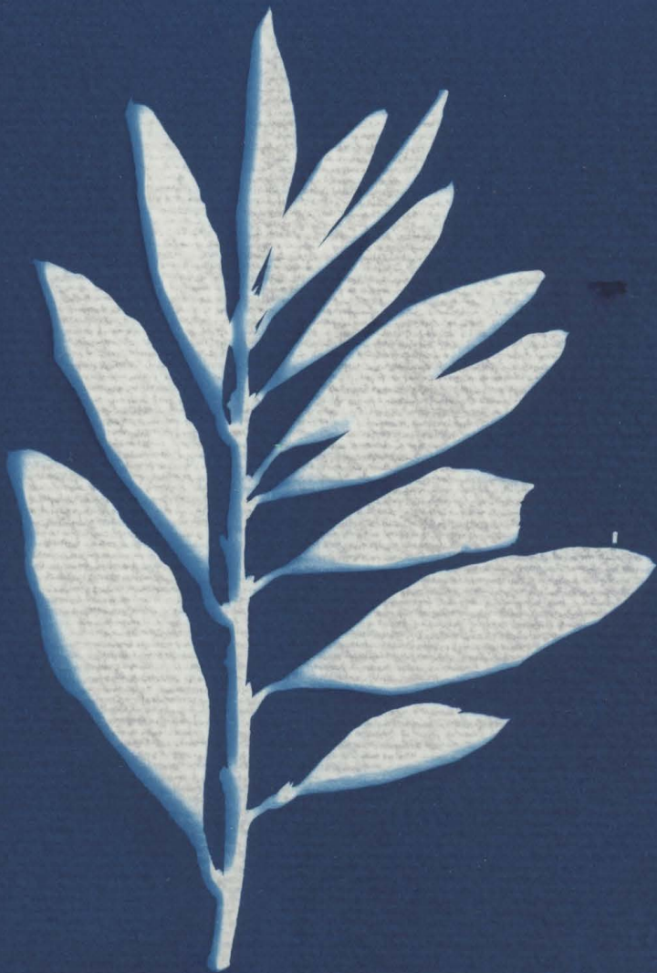
Rasha Tayeh, Olive Leaves cyanotype, 2025.