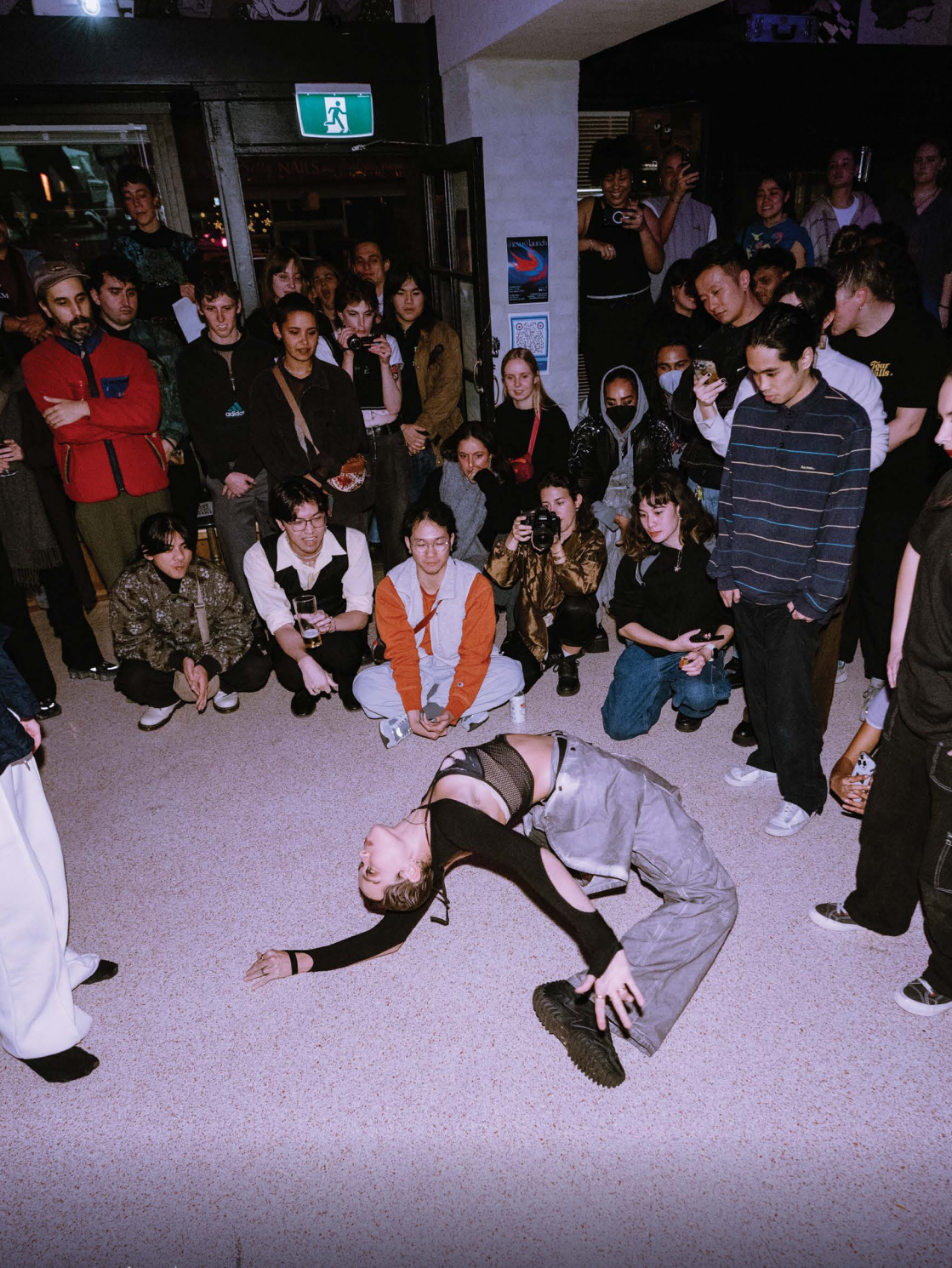
MaggZ, (nexus) launch , 2024, A Rising Tide, Narrm/Melbourne. Courtesy the Artist Photo: Nam Chops