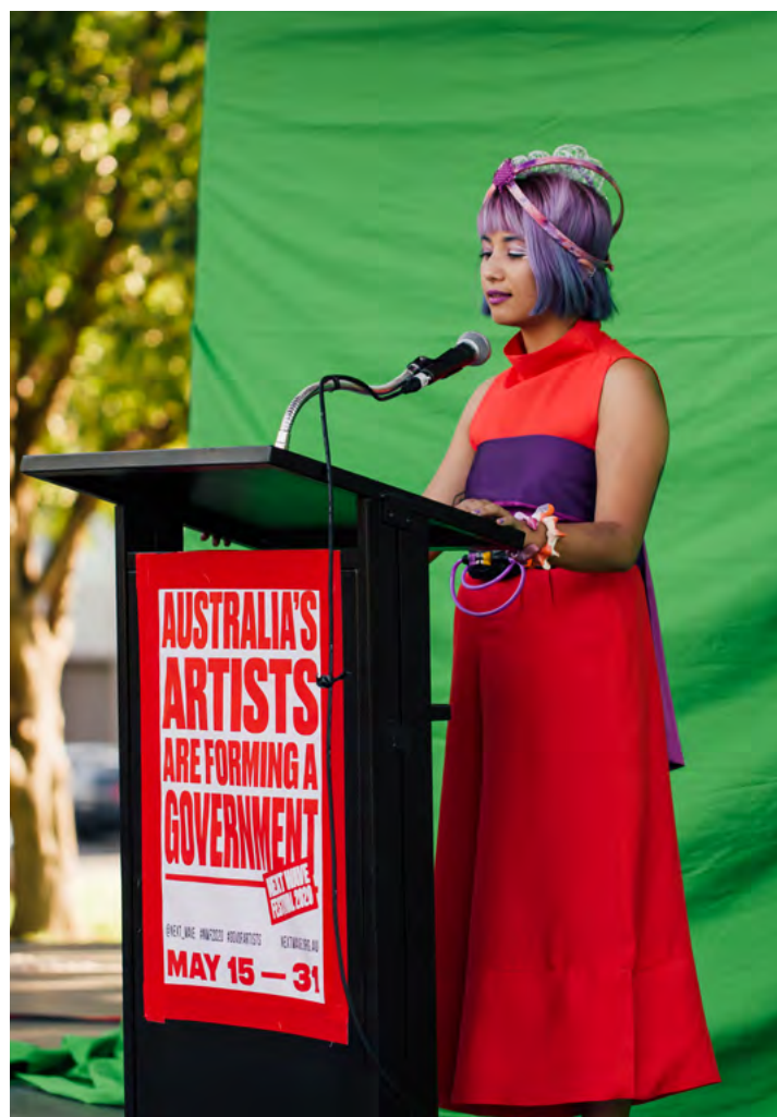
President Poona takes to the stage, Next Wave Festival launch.