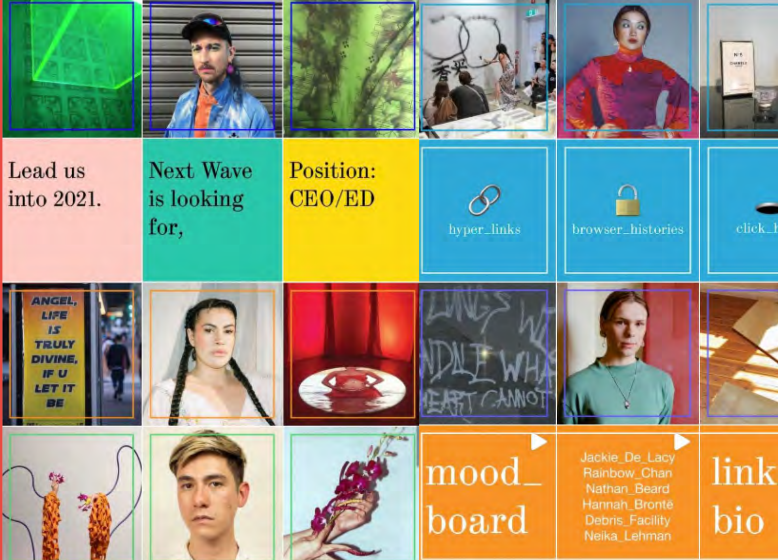
mood_board documented via Next Wave instagram