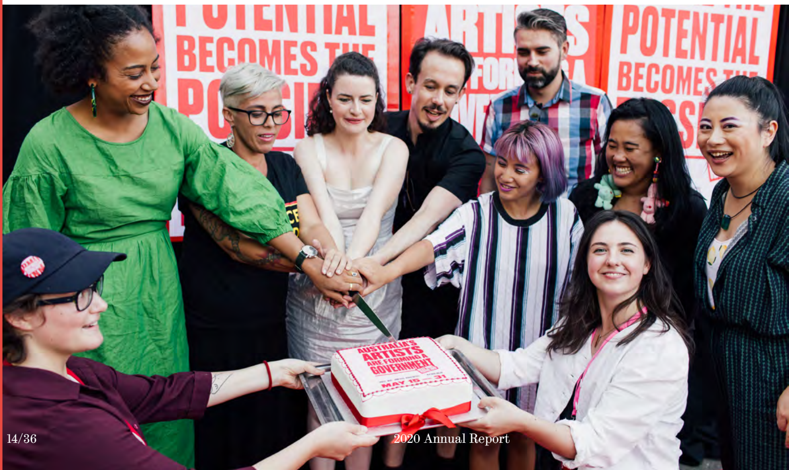
A Government of Artists cake cutting ceremony, Next Wave Festival launch.