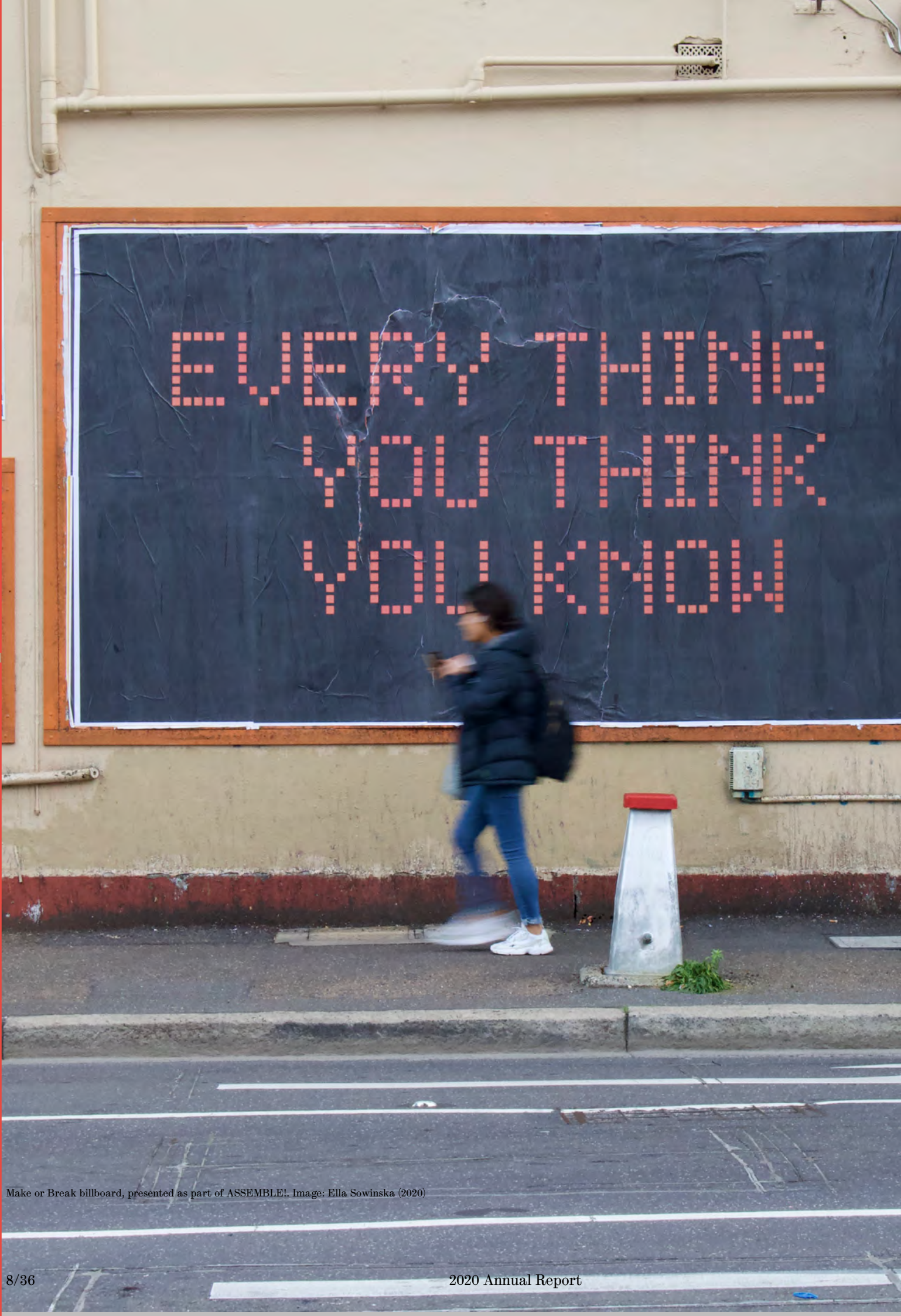
Make or Break billboard, presented as part of ASSEMBLE!.