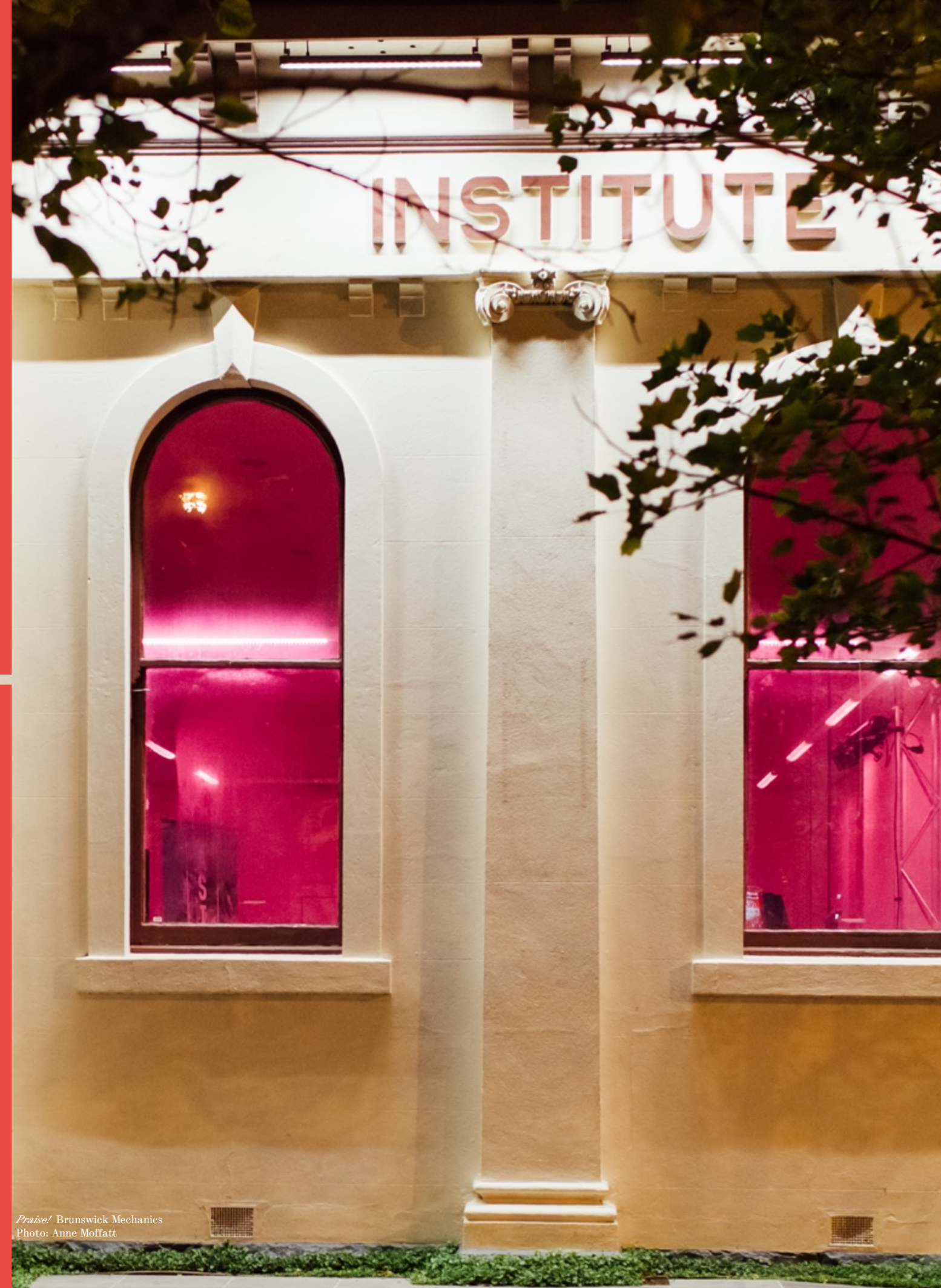
Praise! Brunswick Mechanics