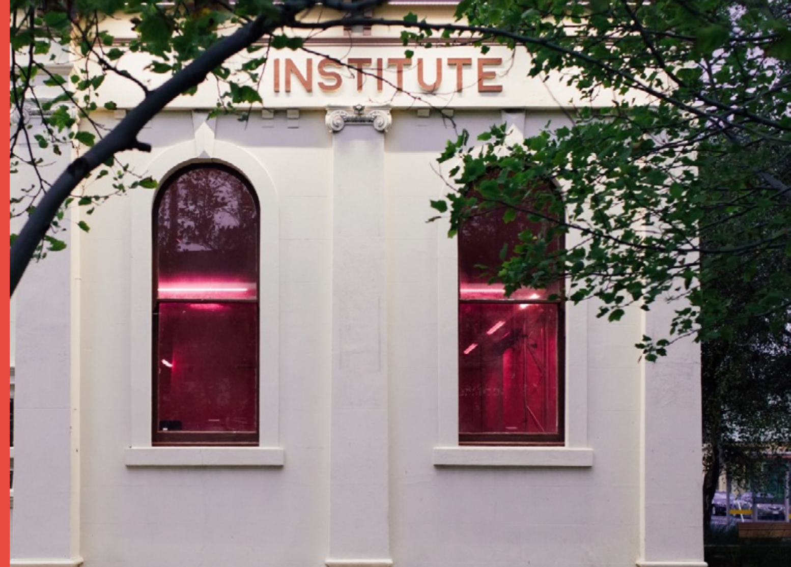
Brunswick Mechanics building facade, pink lights inside.

hours provided in kind to Moreland-based artists