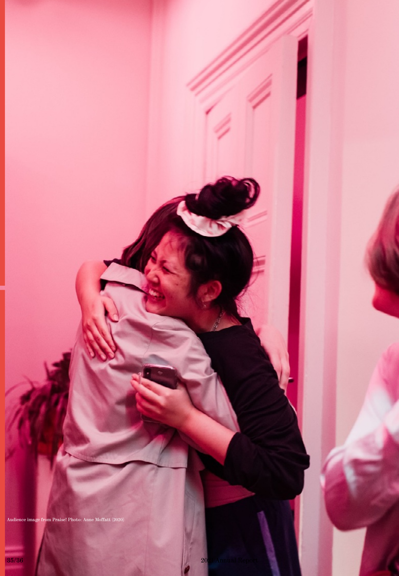
Audience image from Praise!

The accompanying notes form part of these financial statements.