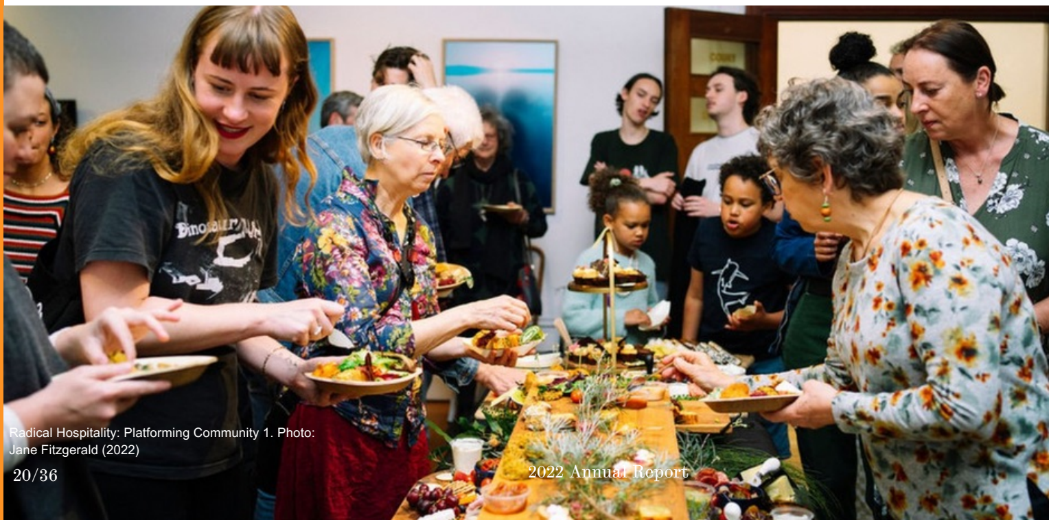
Radical Hospitality: Platforming Community 1.

87% attendance rate at Radical Hospitality programming