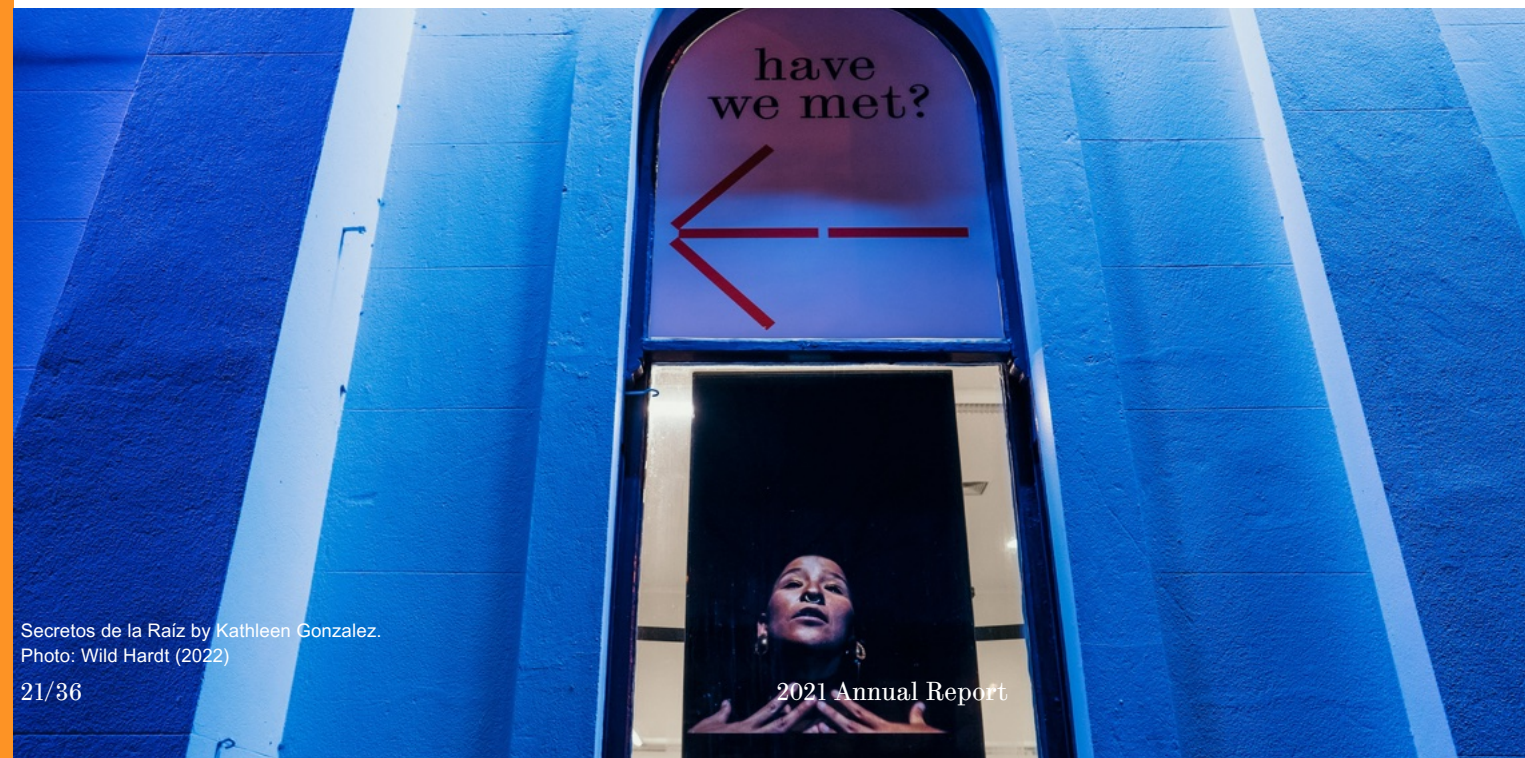
Secretos de la Raíz by Kathleen Gonzalez.

1,152 hours of creative activation of the Brunswick Mechanics Institute Courtyard