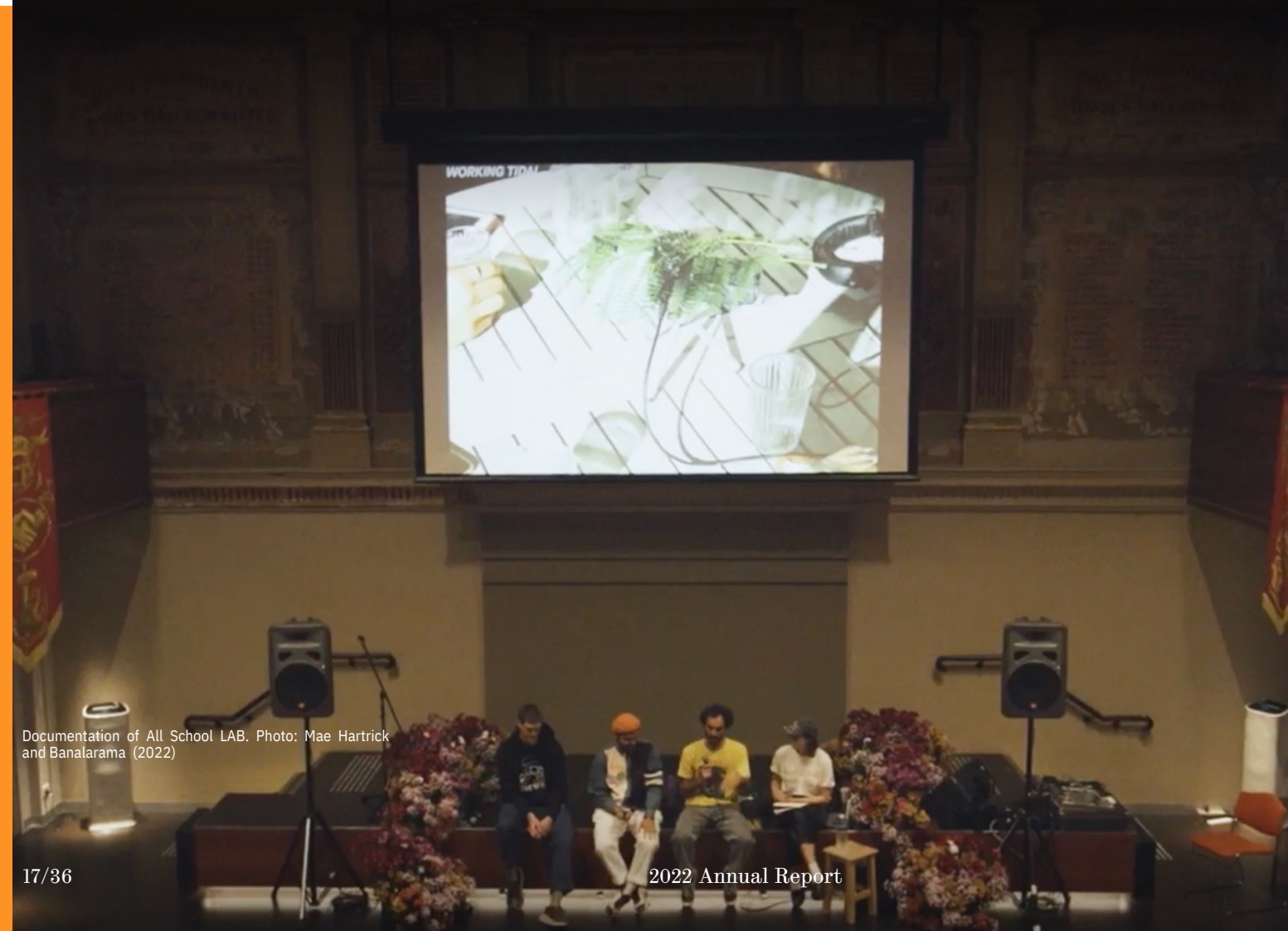
Documentation of All School LAB.