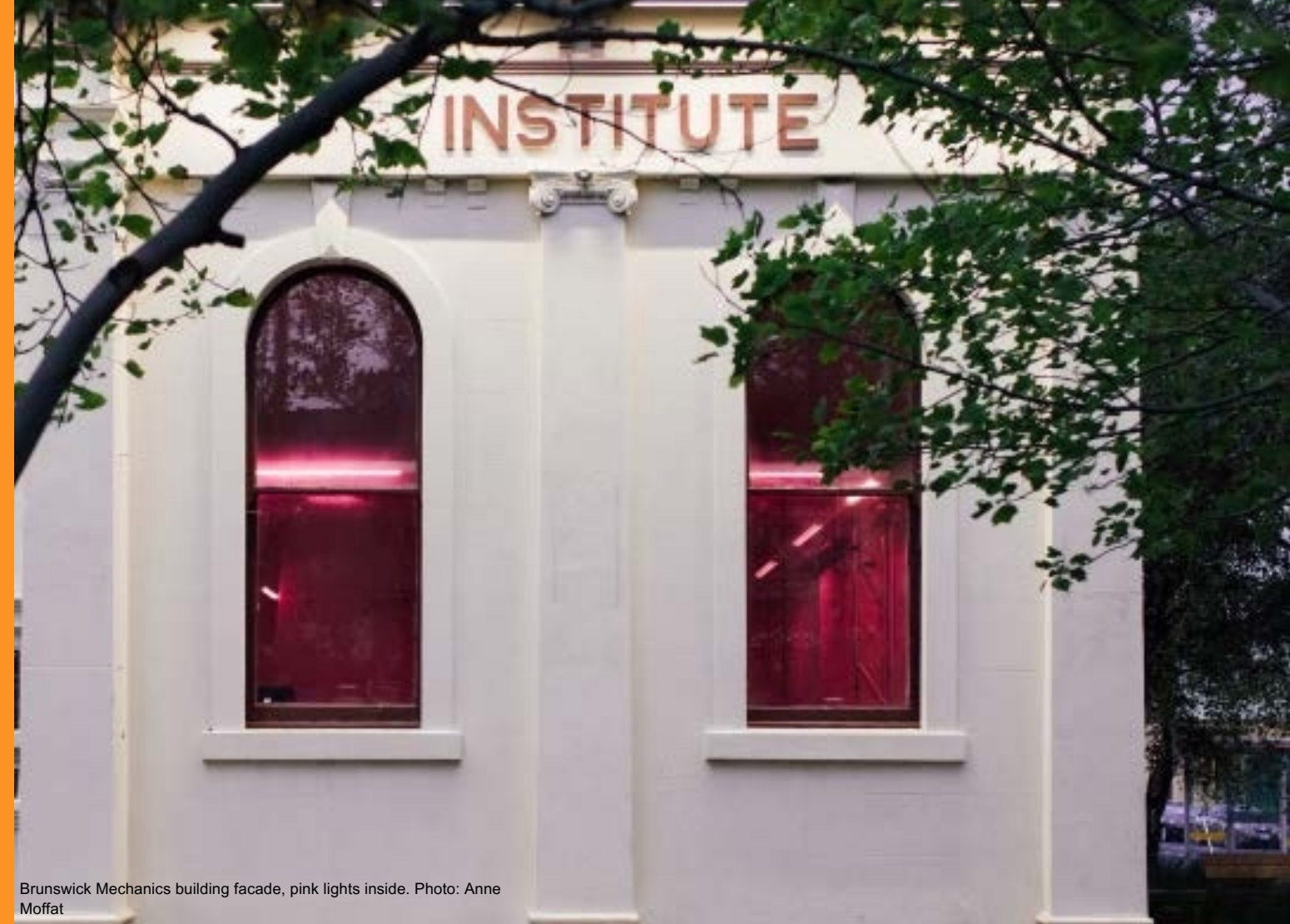
Brunswick Mechanics building facade, pink lights inside.

performance sessions of experimental new work